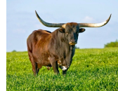
J.R. GRAND SLAM