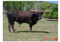
J.R. HOCUS POCUS