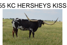
55 KC HERSHEY'S KISS