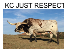
KC JUST RESPECT